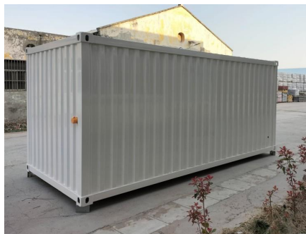
- Rear -