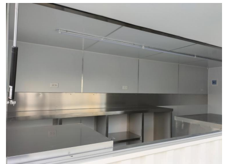
- Interior -