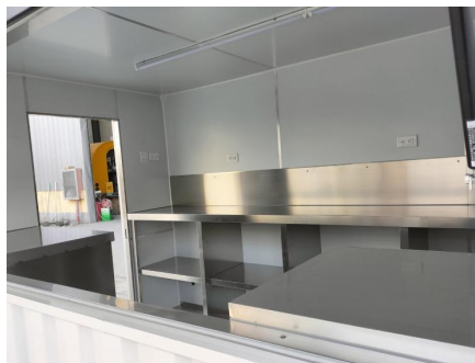
- Interior -