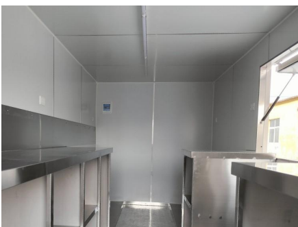
- Walls & Ceilings -