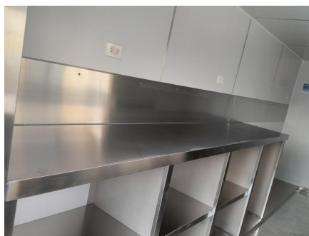
- Table -