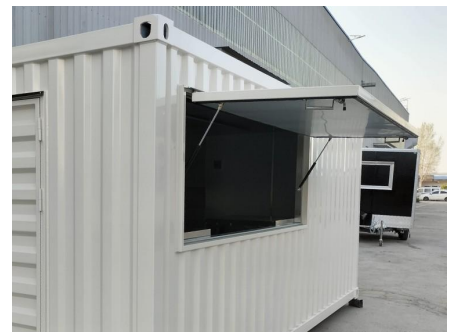
- Service Opening -