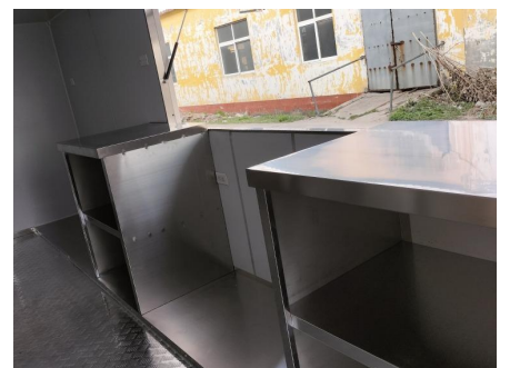
- Table -